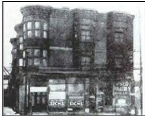
The "Murder Castle" from the street. H.H. Holmes could asphyxiate the guests in their rooms at his whim.